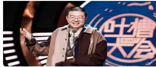
Example 6 Mouth Up Action

impolite utterance. If the utterance is extracted from the context to interpret, conflicts may be unavoidable. When the hearers are calm, their emotions can be pictured as a horizontal line. According to the orientation metaphor, HAPPY IS UP and SAD IS DOWN, the full line indicates the arising tendency of emotion and the dotted line refers to the passive emotional response. Smiling is the mouth-up action. It can render the hearer or the audience the feeling of being friendly and happy, which can effectively shorten the distance among people or eliminate the power discrepancy. Therefore, even though the performers are on the stage, the audience may view them as their friends, whose relationships are equal. The aggressive or offensive words are decoded as a kind of humorous complaining.