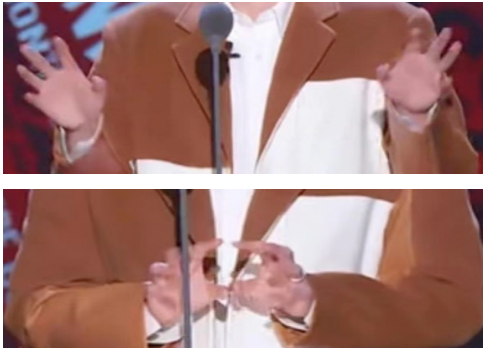
Example 5 Gesture for combination

Talk show delivers its intentions through verbal utterance without the facilitating of written materials. The abstract definitions contained in it sometimes are difficult to seize or understand. Therefore, the comedian uses gestures to make the meaning representation more precise and concrete. Like it is shown in Example 5, the combination of two entities is presented by the opposite direction movement of two hands, and a circle is formed to indicate the successful accomplishment. Each hand represents one thing that has been mentioned in his performance.