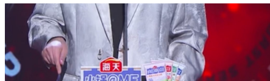
Example 7 Negative attitude held by the downward movement

The performer may also take the advantage of this model to strengthen the correlations. The inner relations of this model can be imagined as being equipped with one hierarchical judging mechanism shown in Example 7. The figure movement is evaluated in the bottom-up model, the emotion performer wants to deliver is criticism and his attitude is undoubtedly negative. He is talking about one injustice event the guest has met. Though the utterance he says is amusing, the real purpose is to dispose of the truth of one thing. To make the guest feel supportive, he uses this kind of gesture or figure movement to stress his detestation of the unfaithful fact indirectly. Therefore, emotional correspondence is established between the audience and the guest. That's why the offensive sentences do not infuriate the guest but make them laugh or delight instead.