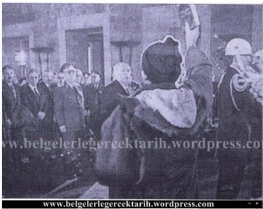
The Event

Thus, the word mezcup became popularized, all of a sudden. In this manner, at the time, it came to the attention of young generations, who were unaware of old Ottoman words.