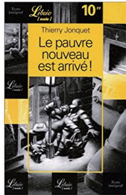
Figure 8 Cover of the Book by Thierry Jonquet (Internet)