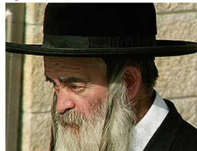
Figure 10 The Above-Mentioned Attire (Internet)

In Samuel G. Freedman's wording, the main theme of the author of the above-mentioned short story, Roth, is "the anxiety of the American Jew: The fear that every hard-won advancement, every material and social comfort—indeed, every sign of genuine acceptance in this overwhelmingly Christian nation—can be wiped away with shocking suddenness" .