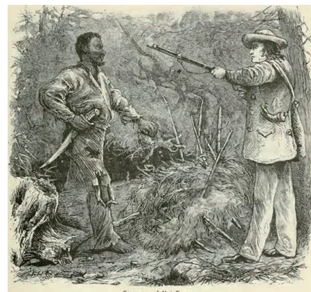
Figure 9 The Infamous Revolt-Leader Nat Turner

Nat Turner (1800-1831) was a young, literate black slave in Virginia. He used to read the Bible and preach sermons to other Blacks around. Eventually he would “receive” some “revelations” from the skies in the line of commands like “thou shall slay the Whites”. With a handful of followers, he would devastate the nearby farms and kill white people. This was a shock to the establishment, who gave him the capital punishment as a penalization of his deeds. Author William Styron turned his story into a historical novel, The Confessions of Nat Turner .