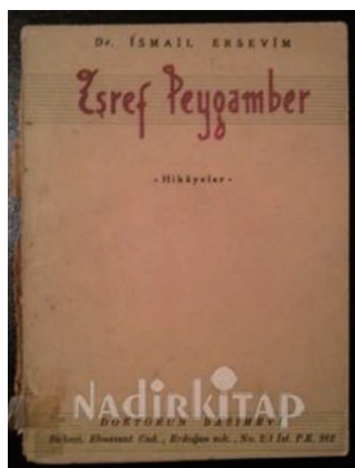
Figure 4 Cover of the Turkish Version of the Book by Ersevîm