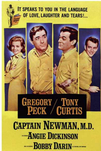
Figure 6 Poster of the Mentioned Psychological Movie (Internet)

even an extremely serious behavior called theo-psychosis or psychosis of divinity may emerge, whereby the person registers a regression back towards the paganist phase of mankind. Through thorough destruction of his faith, he cannot differentiate between the son and the holy spirit within the Trinity.