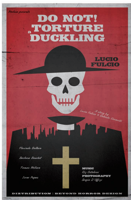
Figure 2 The Poster of the Above-Mentioned Movie in English (Internet)

Don Alberto tries to throw his little sister, a witness to the crimes, off a cliff. Martelli arrives in the nick of time, and after a fistfight between Martelli and Don Alberto, the insane priest loses his footing and falls off the cliff.