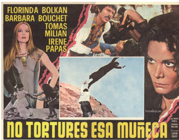
Figure 1 The Poster of the Above-Mentioned Movie in Italian (Internet)