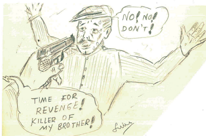
Figure 2 The Climax-Moment! (Illustration by the Author)