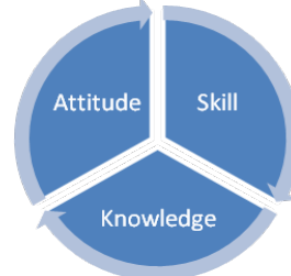
Figure 2: ASK Model

Meanwhile, the ASK model is a theory of education which use to develop the students. Consequently, the application of ASK model in this paper is to study the personality of entrepreneurs which highlight of each component devotes for specific purpose. As attitude refers to the behavior aspects that allow craftpreneurs to conduct themselves as businessman, and to master the attitudes, either personal or professional that could eventually enable them to practice professionally. Skills refer to the business, technical and entrepreneurial skills that enable craftpreneurs to carry out their business properly. Finally, knowledge refers to the professional knowledge that allows craftpreneurs to think and act in a professional manner (Bakarman, 2002). Figure 2 display the concept and combination of attitude, skill and knowledge.