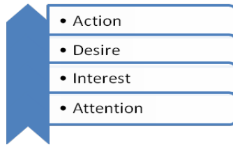
Figure 1: The Concept of AIDA