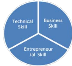
Figure 3: Entrepreneurship skill