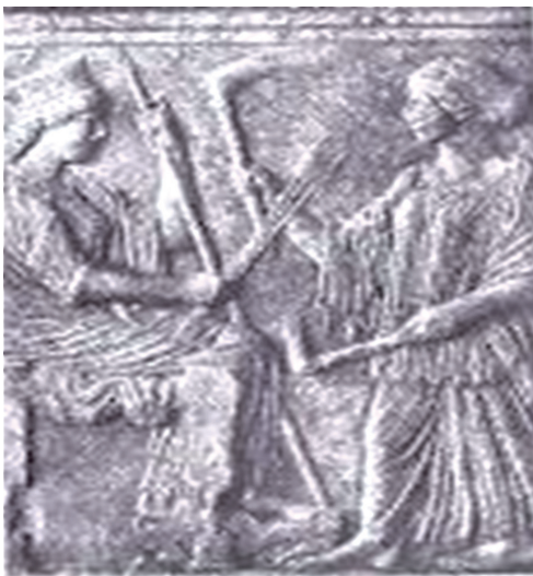
Demeter and Hekate, c. 450 BCE